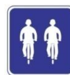
Riding Abreast Permitted (sign)